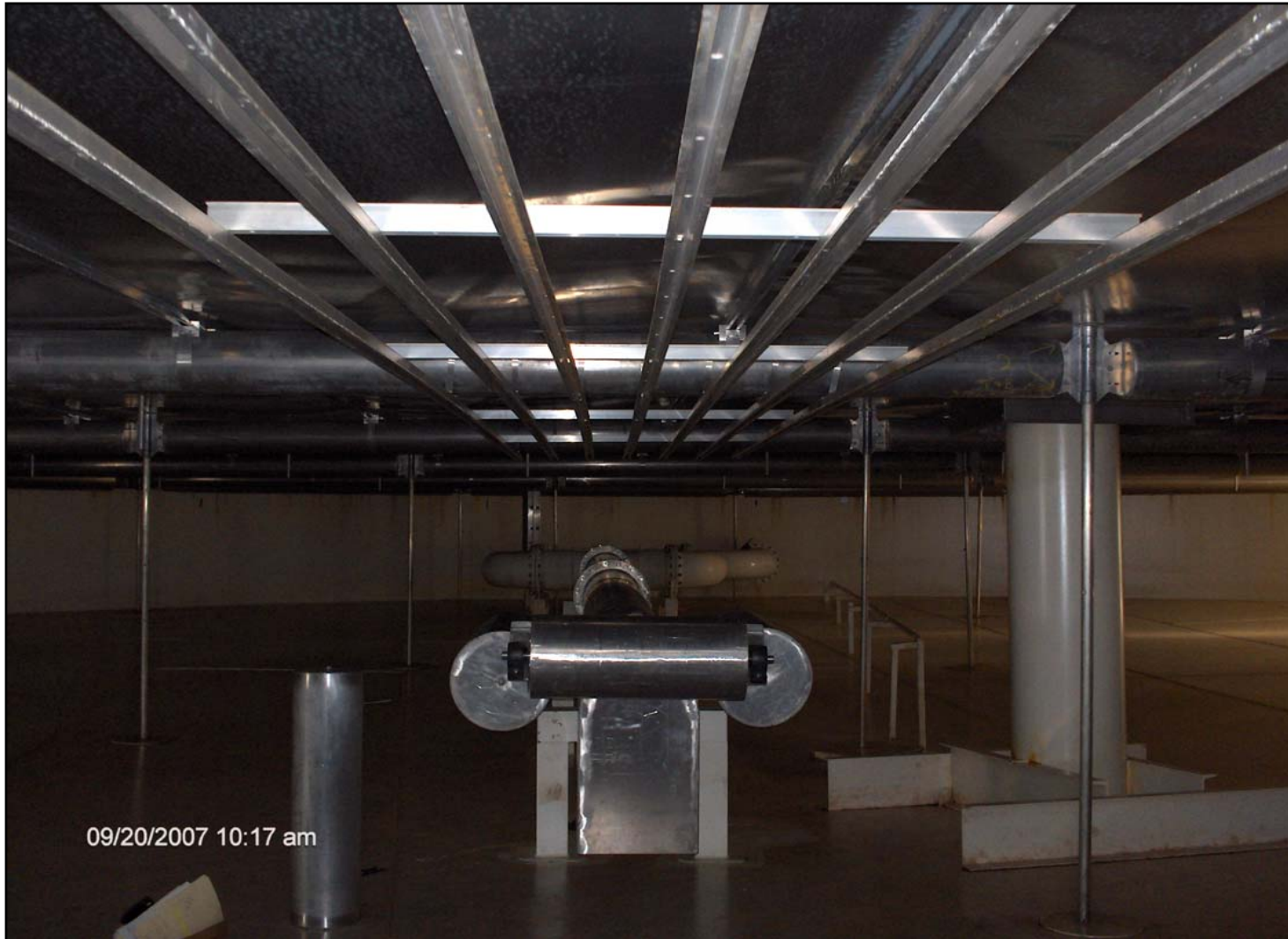
Photograph showing an existing GNY project of 18" Floating Suction Assy. with roller and two side floats, in USA. Also shows floating roof with Aluminum channel on which the roller are rolling. Channels will be supplied and installed by buyer at the site.